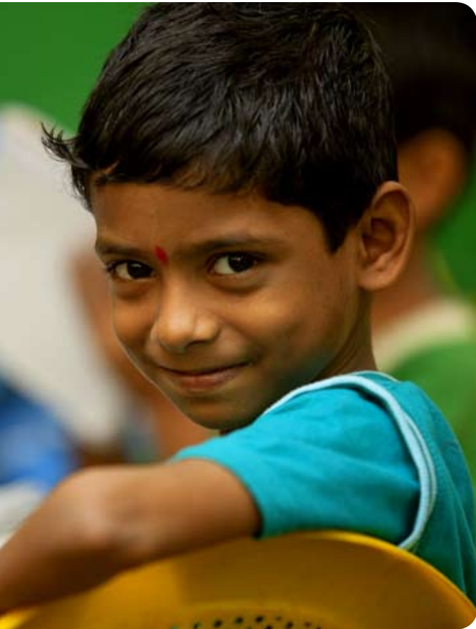
ALL SMILES A Mukhtangan student in school

“Atma’s approach to the issue of Quality Education is completely innovative. By taking a more macro view, Atma has positioned itself to bring change in our focus area of Quality Education as well as the development sector as a whole. It is an exciting and dynamic organisation to be a part of. I am excited to see what the future holds for Atma as it continues growing and expanding its mission.”