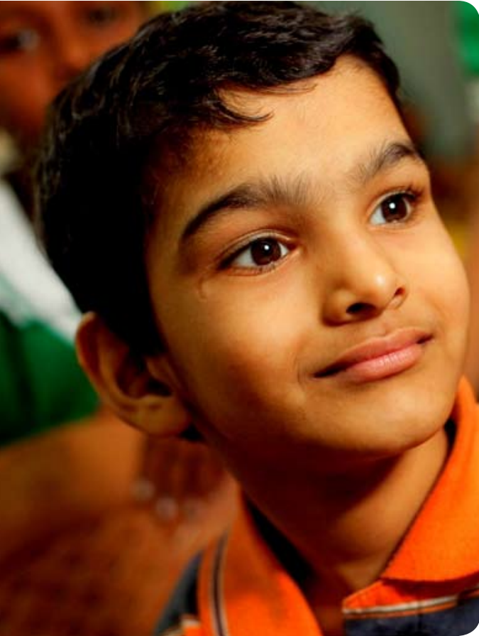
ATTENTION A student at CHILDReach

"I've moved away from day to day thinking and am focusing further down the line, at one year or three years in the future. We are working on concrete goals and setting new ones."