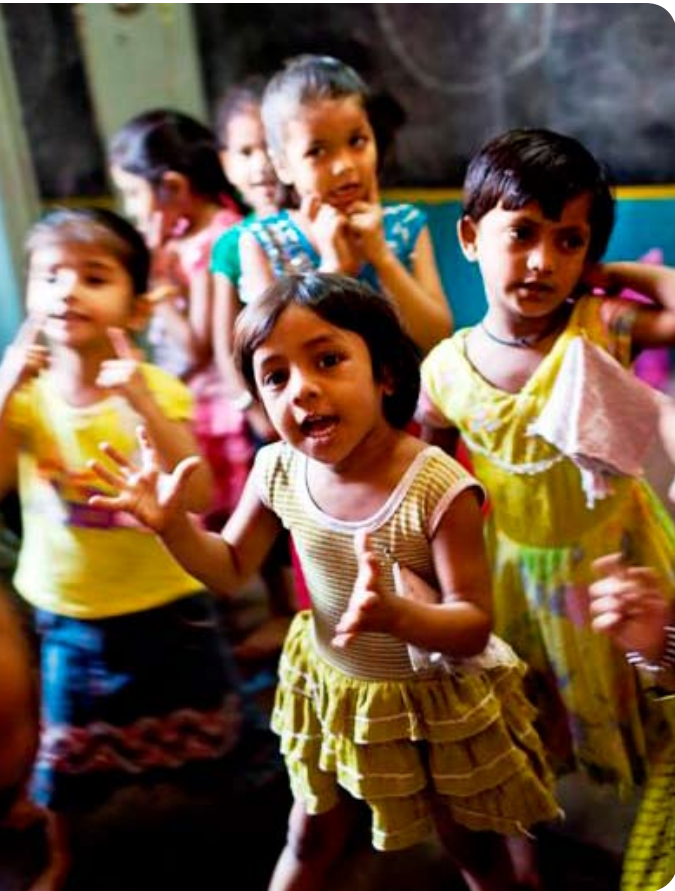
PLAY Students in a dance class at Muskaan Kindergarten

“The most helpful part of the Atma partnership has been their assistance in high level strategic discussions. As a small organisation, we often get caught up with day to day problems, yet in meetings with Atma, we take a step back to consider the bigger picture. Because of their expertise in educational development, we gain an invaluable perspective as well as access to other NGOs and support.”