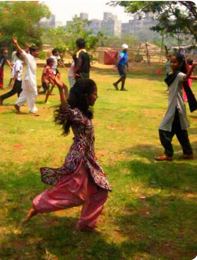
ENTHUSIASM Students playing games at summer camp

“Atma has been very consistent in its support over the last 3 years, helping us to leverage our networks for funds, resources, volunteers and program partnerships. The Atma Partnership has helped us define our work and enhance our programs, constantly requiring us to reflect on the outcomes and set up processes that help our efficiency.”