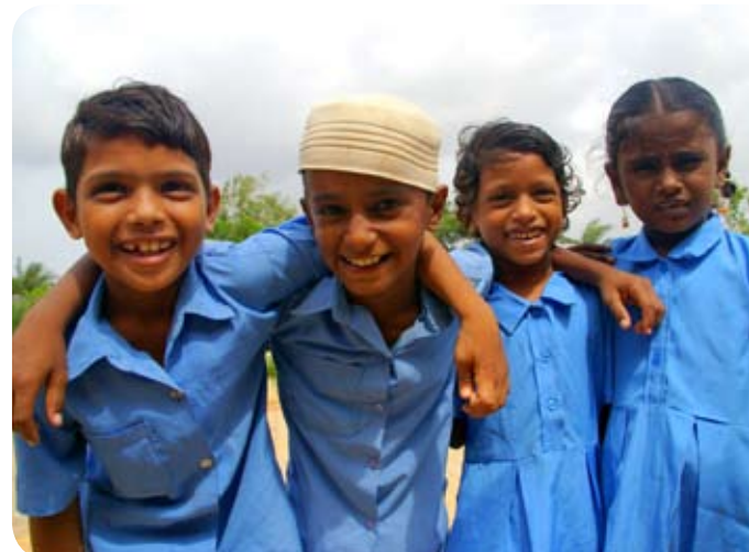
TEAMWORK CHIP students at play

12 distinct outcomes 36 Hours Advocacy 30 Hours Atma Workshops 143 Hours Consultancy 10 Hours Partner-Specific Training 3 Volunteers 1100 Hours Volunteering 200 Hours Volunteer Support 1519 Hours Total Partner Contact