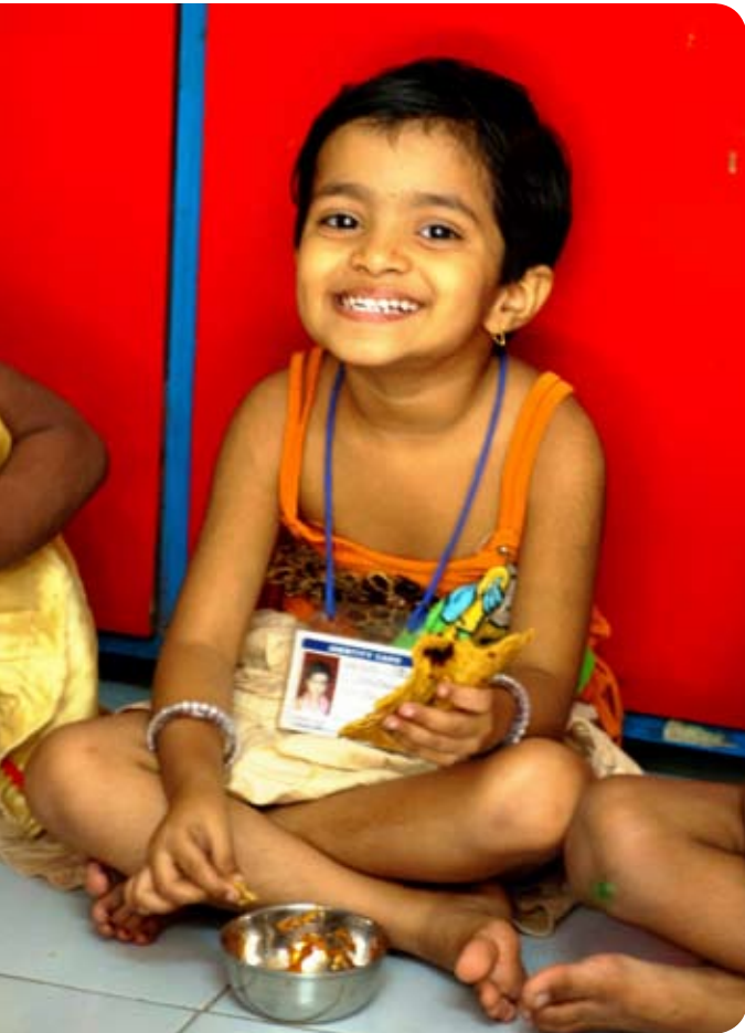
HEALTH A little girl enjoying a nutritious snack at FMCH

“The Atma Partnership has given FMCH the necessary skills and support to grow the organisation. In the beginning of 2010–2011, we had 175 beneficiaries. Through Atma’s guidance and professional volunteers, we were able to reach over 350 beneficiaries and open two new centres. Without providing ‘stepping stones’ to navigate the growth process, we would not have had the ability to increase our outreach to such an extent.”