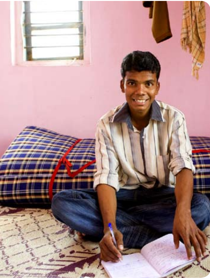
STUDYING A Masoom night school student

“Atma and the Atma volunteers have been a great support for Masoom. Planning meetings with Atma helps us prioritise issues to work on, and volunteers provide the hands-on support we need to execute our plans.”